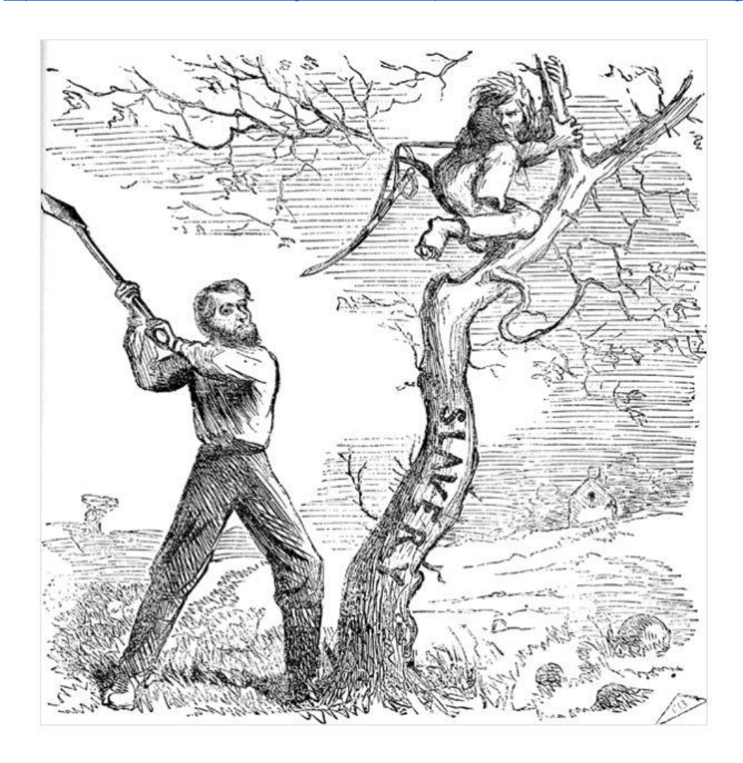
Source 2: Title: Lincoln's Last Warning Year: 1862 Creator: Frank Bellew, Harper's Weekly: <a href="http://abrahamlincolnsclassroom.org/cartoon-corner/president-lincoln/lincolns-last-warning/">http://abrahamlincolnsclassroom.org/cartoon-corner/president-lincoln/lincolns-last-warning/</a>

Was this cartoon created from a northern or southern perspective? Explain the main idea of the cartoon and use evidence from your learning this unit.