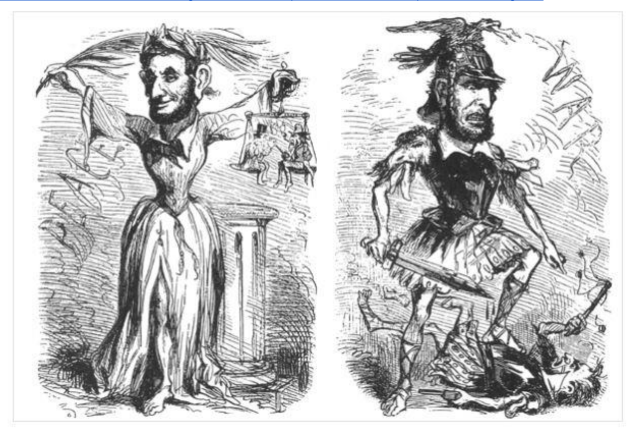
Source 1: Title: The President's Inaugural Year: 1861 Creator: Thomas Nast, Frank Leslie's Illustrated News: <a href="http://abrahamlincolnsclassroom.org/cartoon-corner/president-lincoln/the-presidents-inaugural/">http://abrahamlincolnsclassroom.org/cartoon-corner/president-lincoln/the-presidents-inaugural/</a>

Which cartoon represents the Northern perspective? Explain the main idea of the cartoon and use evidence from your learning this unit.